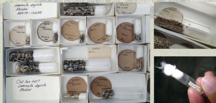
Figure 2: Examples of the issues threatening the security of BPBM land snail collections.