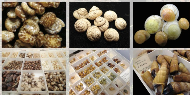
Figure 3: Some BPBM land snail collections from across the Pacific

The Bishop Museum (BPBM) has nearly 4 million land snail specimens in more than 180,000 cataloged lots ( ca. 13,000 type lots). Species in the collection represent 90% of the Pacific island geographic regions (Fig. 3).