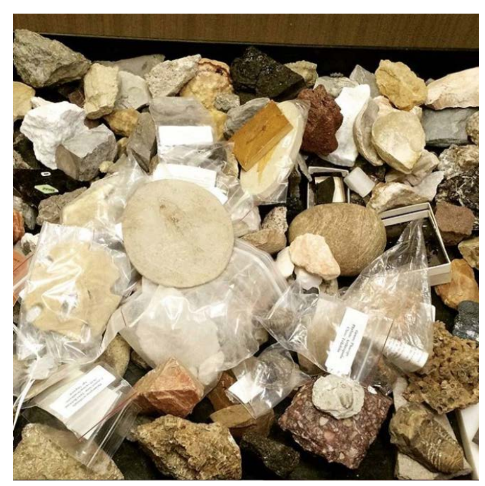
IGWS Education Collection, 2016