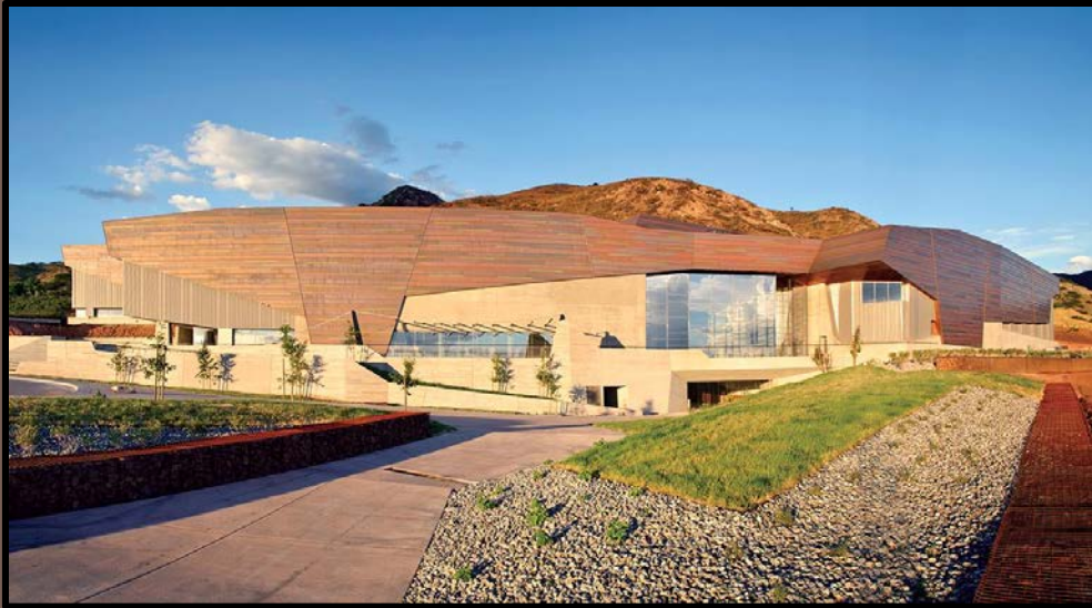
Utah Museum of Natural History in Salt Lake City