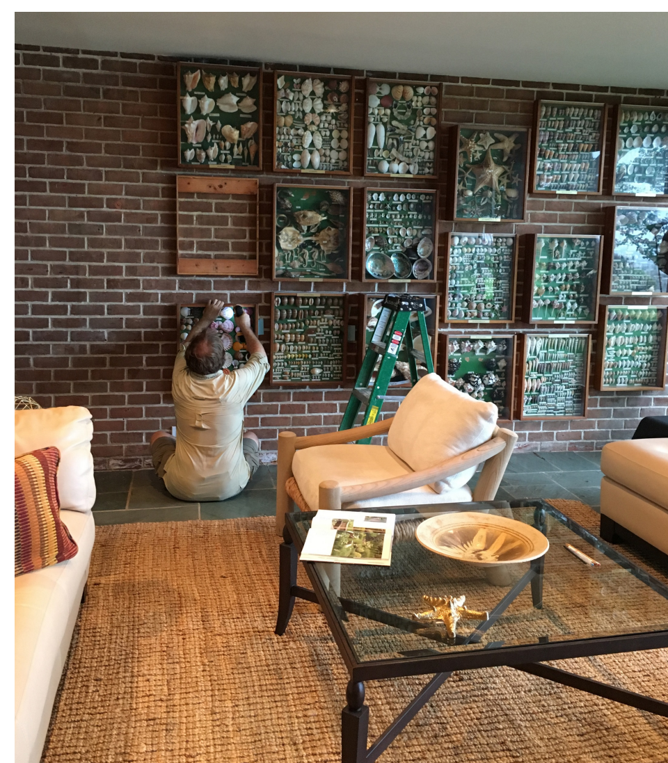
Retrieving the Rosen Collection