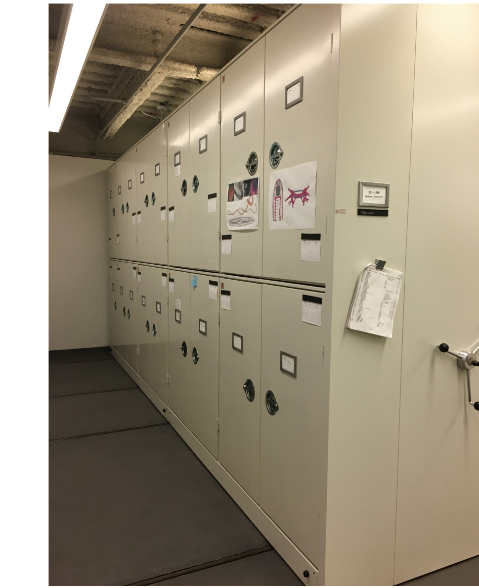
Wet Storage (wet storage bldg)