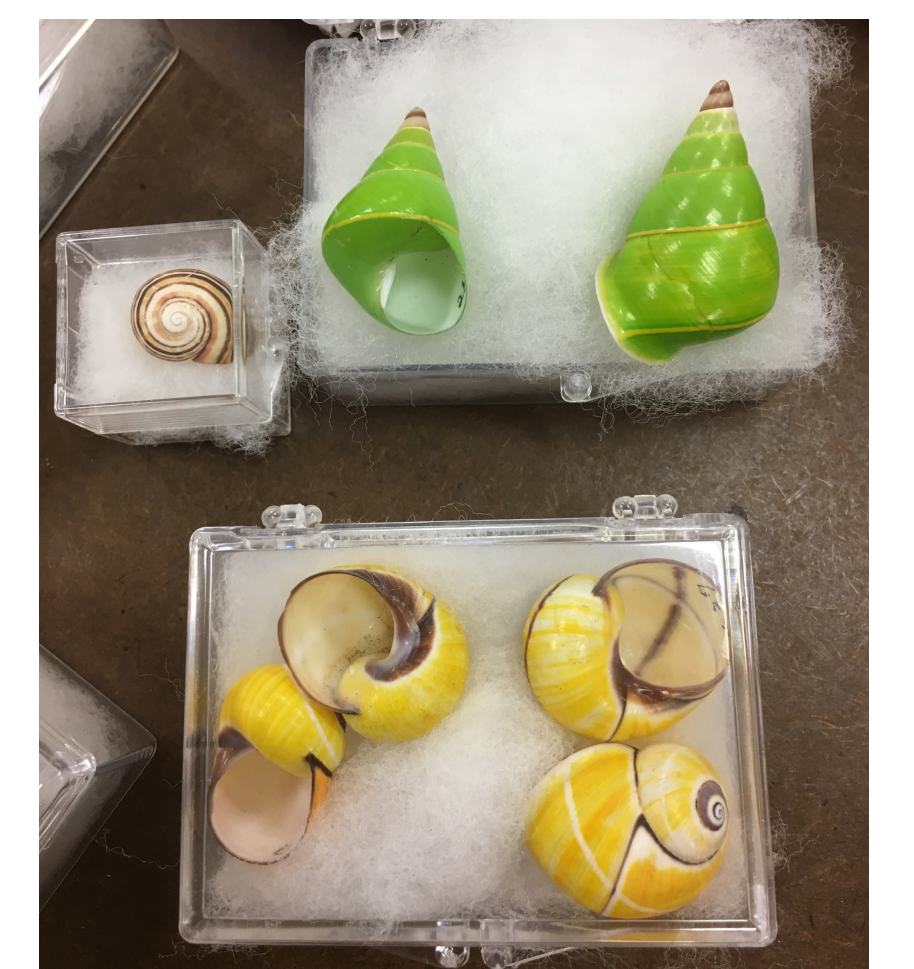
Cuban snails from Dupree Collection