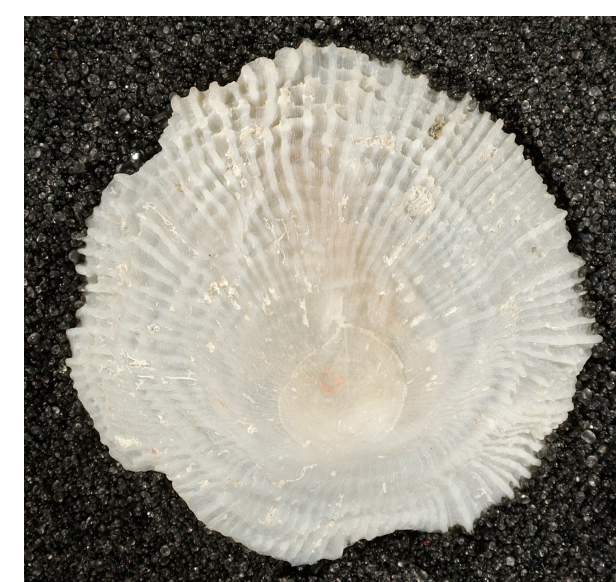
Chelia equestris striata