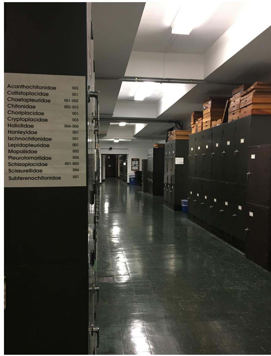
Dry Storage (halls)