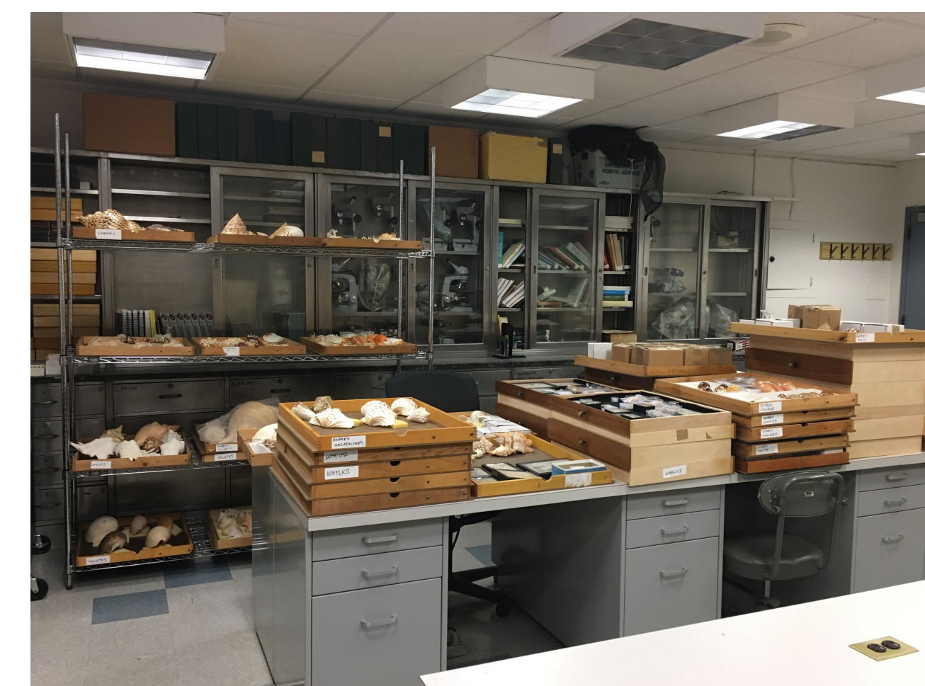
Processing the Dupree Collection