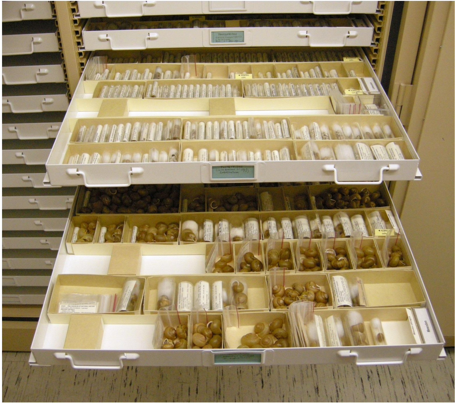
Fig. 1. Millions of uncatalogued natural history specimens exist in Museums across the country. Unlocking the data associated with the Mollusk and Arthropod specimens that are part of the InvertEBase TCN will provide an extensive baseline of terrestrial and aquatic biodiversity of the eastern United States.

INTRODUCTION: North America is projected to experience profound biodiversity change in coming decades that will have extraordinary and unpredictable consequences for all U.S. ecosystems. Understanding the scope of that change requires a high resolution picture of preexisting biodiversity levels. Natural history museums contain that information, but not in a form that is readily accessible to a broad variety of end users (Fig. 1).