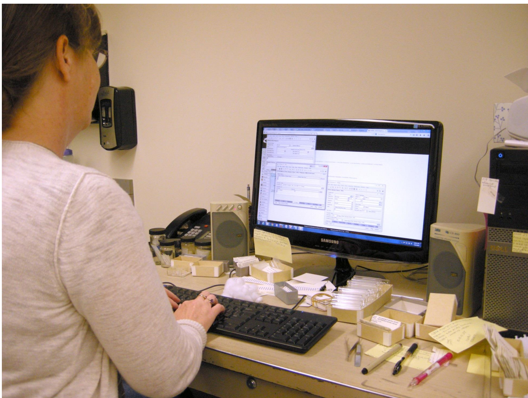
Fig. 4. Field Museum. Pre-curated unionid bivalve lots for data entry, completed work flow development and staff training; entered data records of over 6,000 North American fresh water mussels and land mollusks (Margaritiferidae, Unionidae, Sphaeriidae) directly into the FMNH collections database (Emu); prepared records for uploading to Symbiota; developed authority file for North American land and fresh water mollusk taxonomy.