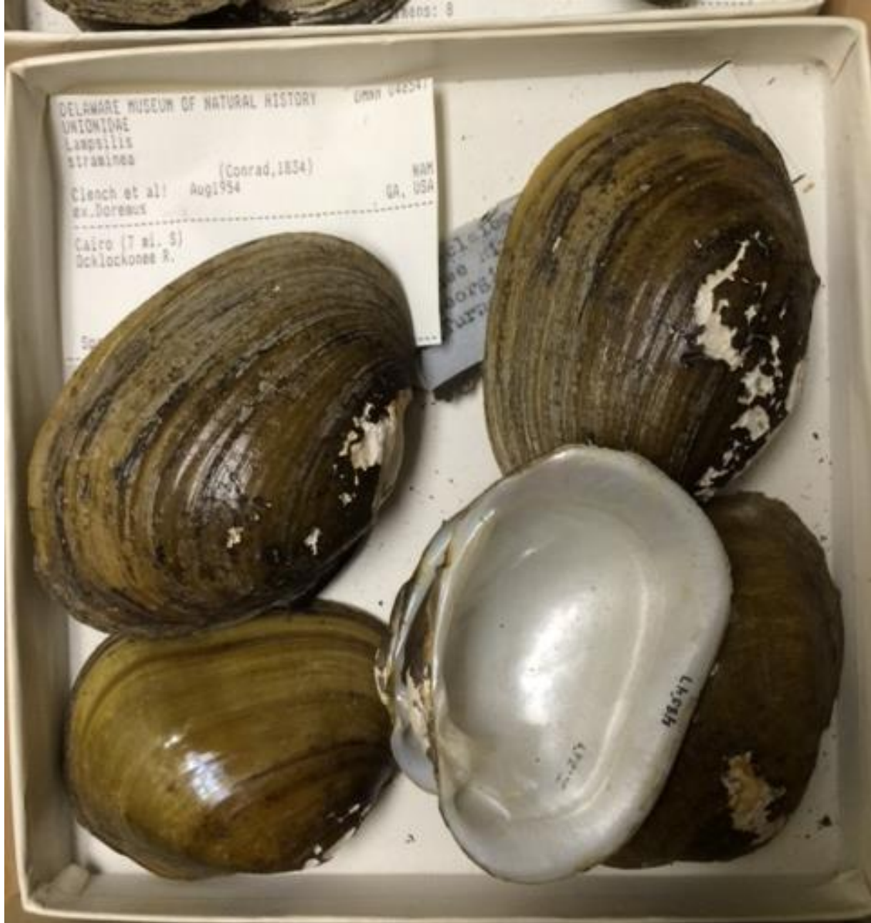
Fig. 3. Delaware Museum of Natural History. Hired a part-time database specialist and upgraded server infrastructure. Revised taxonomy, geography, agent names and inventoried 7500 freshwater unionid bivalve lots (pictured above). Prepared a translation table to map current fields on to the Specify v. 6 data schema.

All collections made significant digitization progress in Year 1. In addition to the results outlined below, the Field Museum collaborated with the Cleveland Museum of Natural History to assess their Mollusk collection.