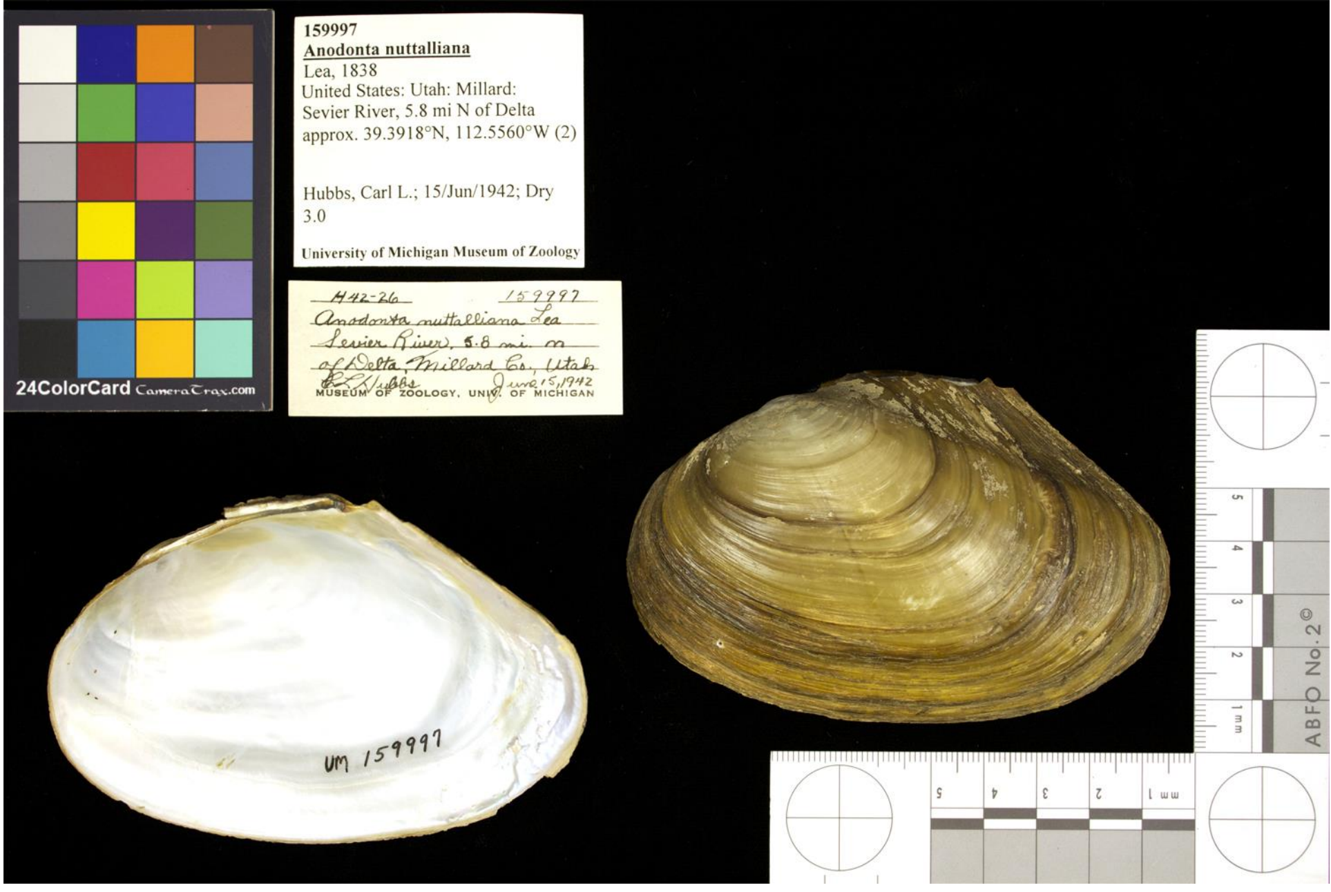
Fig. 5. University of Michigan Museum of Zoology. One graduate and seven undergraduate students were hired; performed over 18,000 data entries representing freshwater snails (Lymnaeidae: 3022; Planorbidae: 4055; Physidae: 2106; Valvatidae: 1330) and freshwater bivalves (Sphaeriidae: 4698); imaged over 3500 lots of unionids (pictured above), sphaeriids and pleurocerids; prepared for records upload to Symbiota.