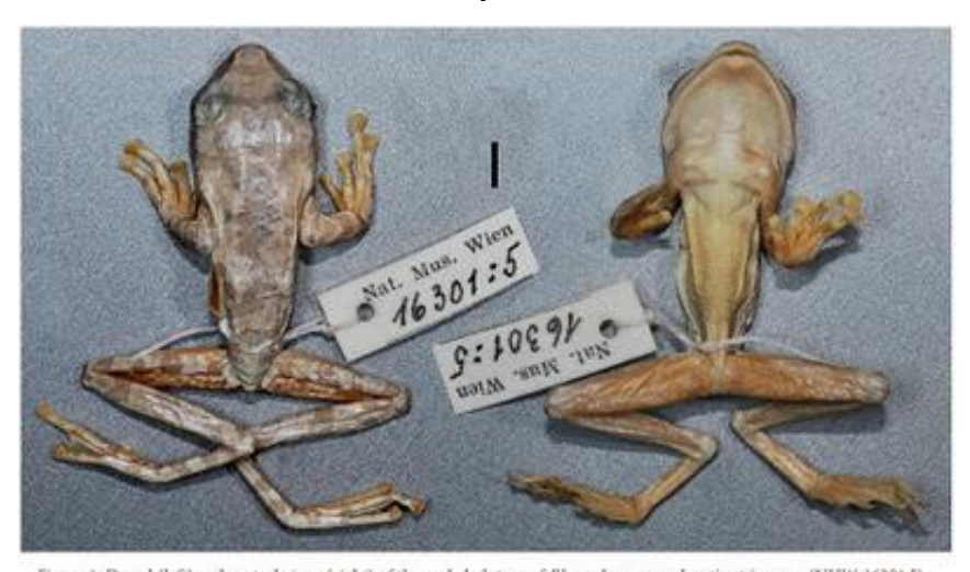
Figure 1. Dorsal (left) and ventral views (right) of the male holotype of Rhacophorus pseudacutivistris sp. n. (NHW 16301:5). Scale bar = 5 mm.

Gil Nelson Wet Collections Digitization Workshop 4-6 May 2013